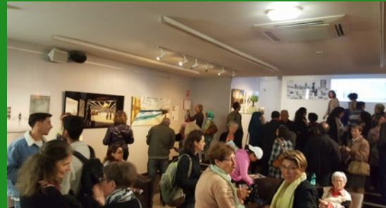
Opening of the exhibition « Nation Estate »