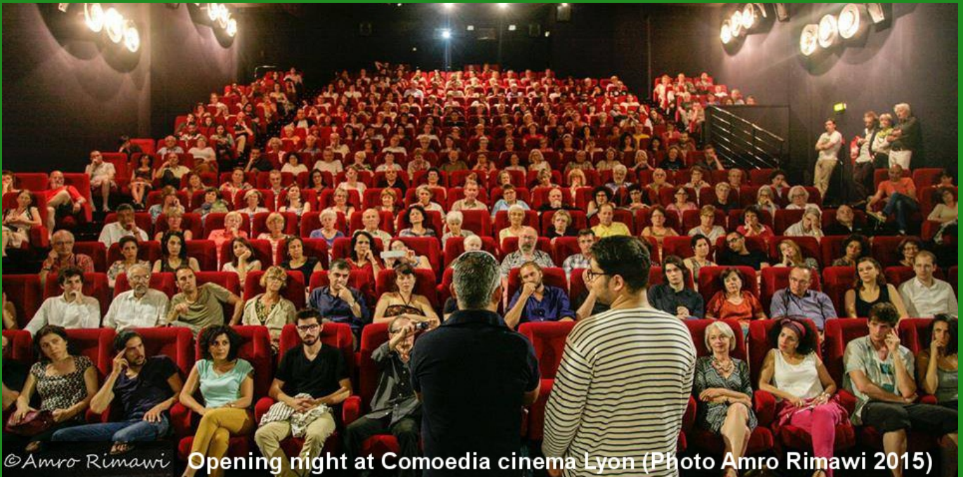
Opening night at Comoedia cinema Lyon

The Palestinian movie festival in Auvergne-Rhône-Alpes has confirmed for two years the interest of this ambitious project of ERAAP association. This project met the positive response from many people and various local groups all interested by the idea of a "Palestinian movie festival", and also from a wider audience. The festival "Palestine in view" gives a more varied image of Palestine, different from the usual stereotypes. It showcases the filmmakers and actors thereby assuming its vocation of support of the Palestinian cinema.